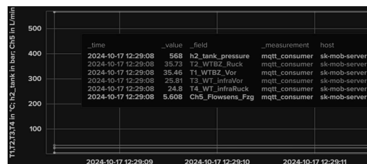
Figure 2. Measurements of temperatures, flow (Ch5), and hydrogen pressure (h2_tank) directly from InfluxDB.

Sample measurements obtained on October 17 th , 2024 from the temperature sensors at the EHE are shown in Figure 2.